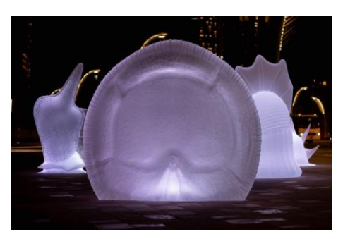
Figure (7) Monira Al Qadiri ,Zephyr, Five plexiglass sculptures, sculptures in acrylic glass, WEST BAY BEACH FRONT, Qatar museum, DOHA, QATAR- 2022