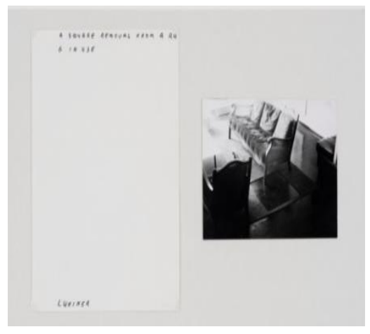
Figure (5) Lawrence Weiner, A Square Removal from a Rug in Use, Photograph, text sheet: felt pen on paper, 8.27 inch x 6.3 inch, 1969