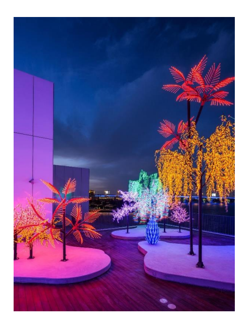
Figure (8) Alia Farid & Aseel AlYaqoub, Contrary Life: A Botanical Light Garden Devoted to Trees ,Plastic, metal, light bulbs and electrical wire, ameel Arts Centre, Dubai.2018 Jameel Arts Centre, Jameel Arts Centre, Jaddaf Waterfront, Dubai, UAE