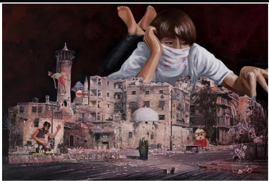
Figure (6) Artist shurooq amin, The Moving Dollhouse, Mixed Media Acrylic Painting, 110 x 200 cm,2016 www.shurooqamin.com